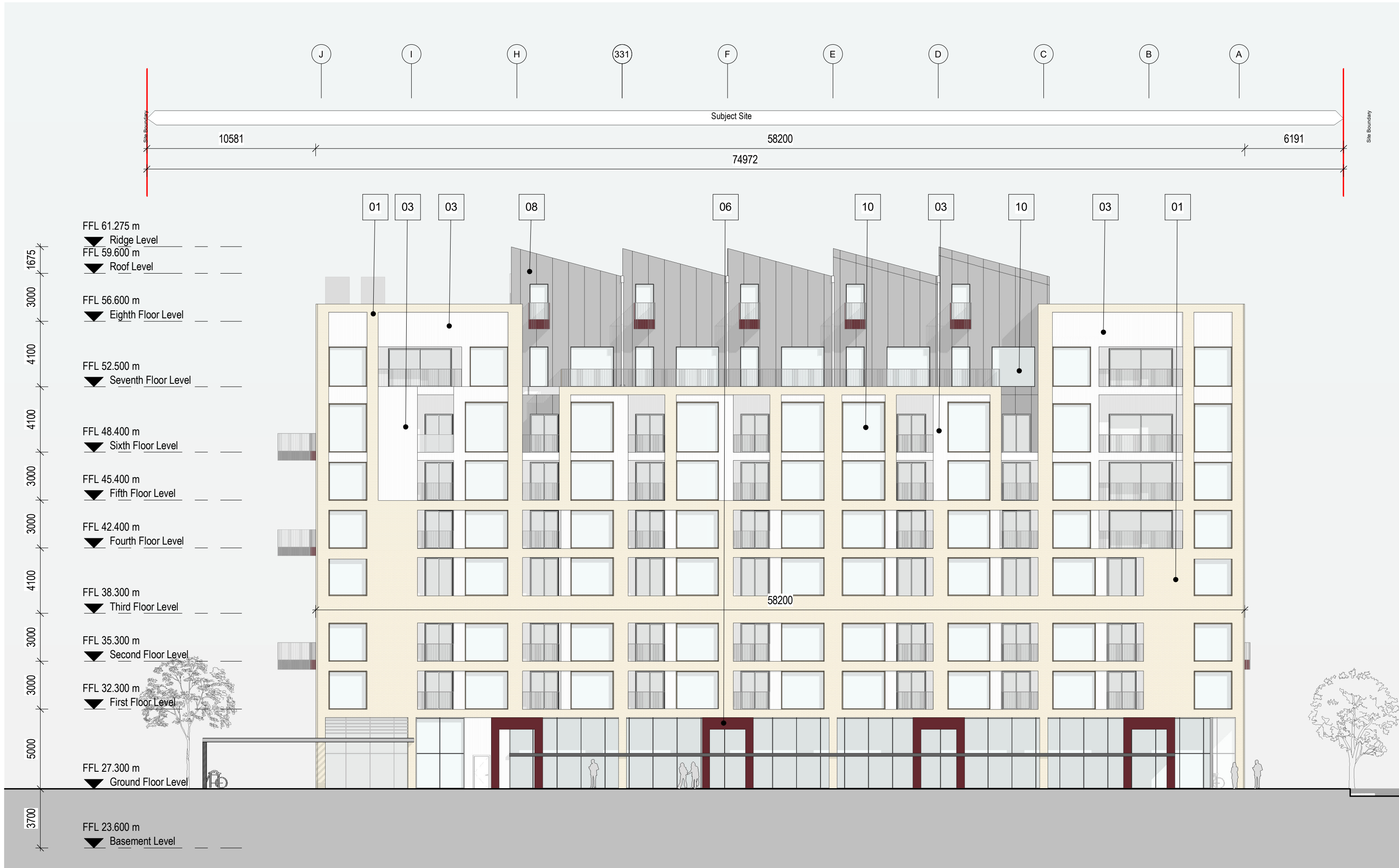
2 West Elevation 1:200