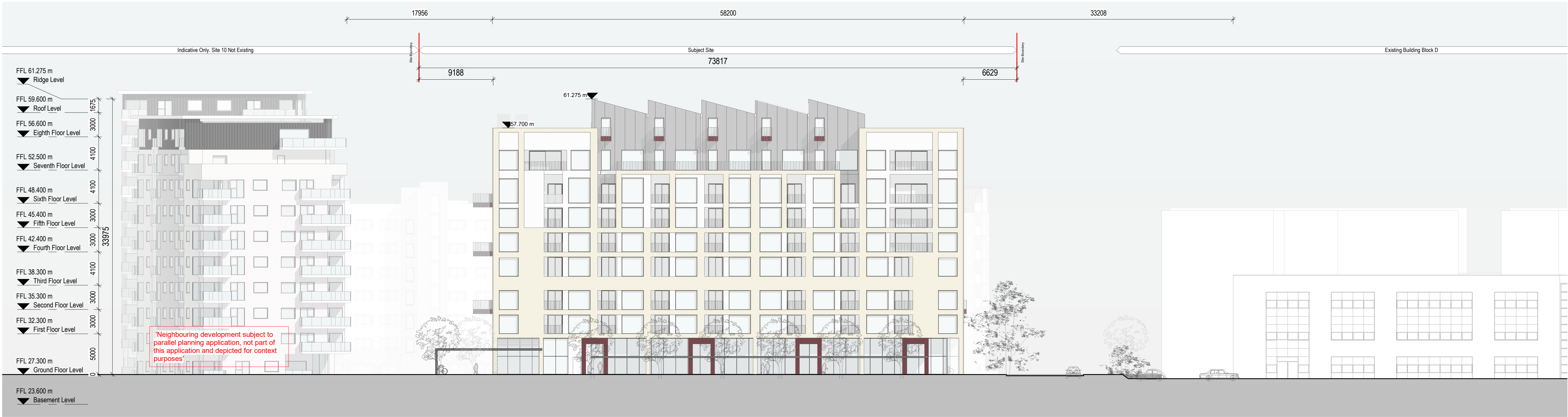
2 West Contiguous Elevation 1 : 250