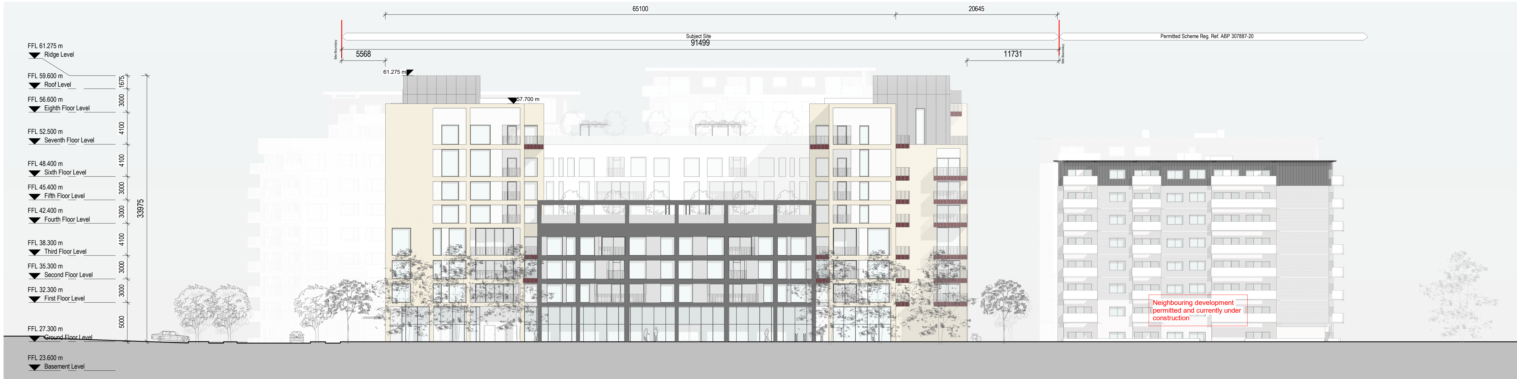
1 South Contiguous Elevation 1 : 250